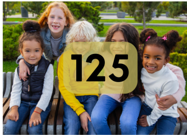
Number of Kids