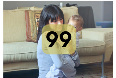
Number of Adults