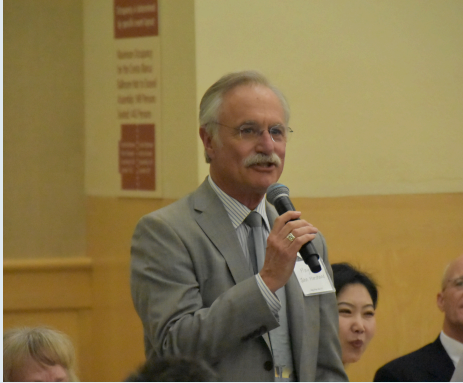
TVH ANNUAL GALA - WINGS OF HOPE

Tri-Valley Haven's 2025 Gala was an evening of celebration and shared commitment, bringing our community together to sustain and strengthen our core services.