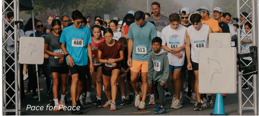
Pace for Peace