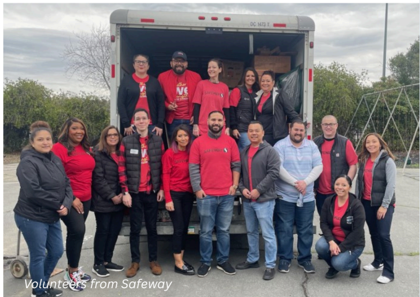
Volunteers from Safeway