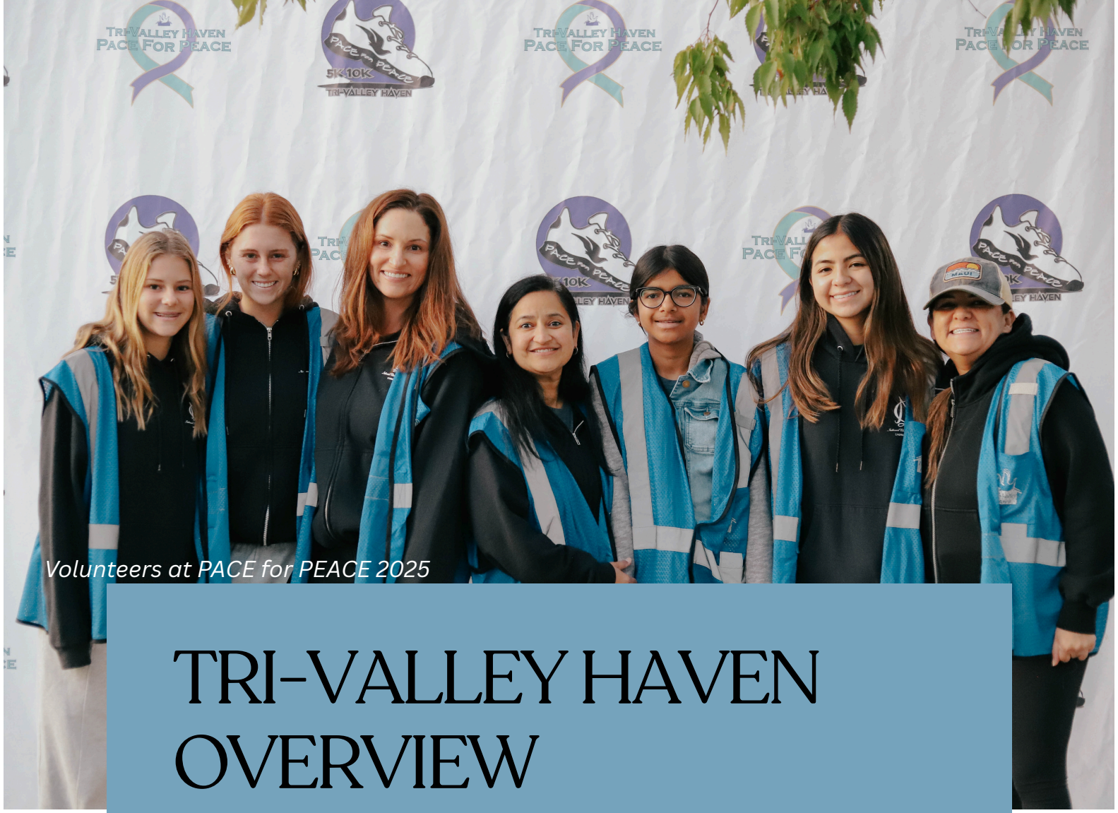
Volunteers at PACE for PEACE 2025