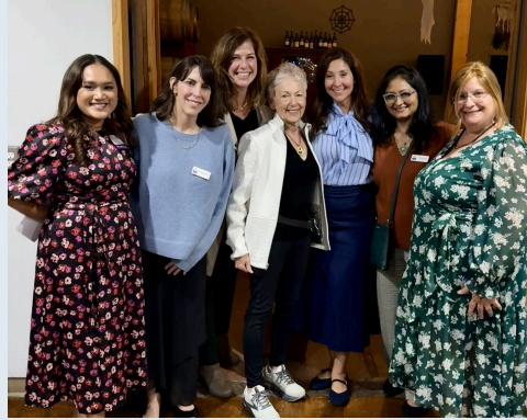
DONOR APPRECIATION EVENT

Tri-Valley Haven's 2025 Gala was an evening of celebration and shared commitment, bringing our community together to sustain and strengthen our core services.