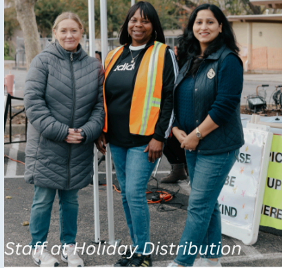
Staff at Holiday Distribution