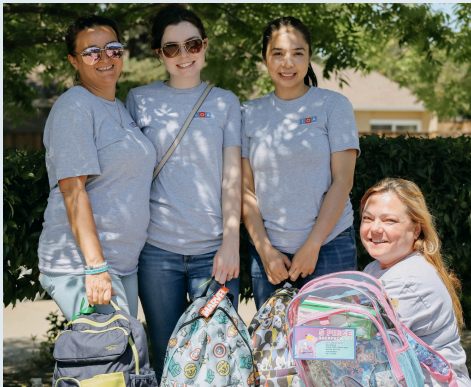
BACKPACK DRIVE & DISTRIBUTION

The Volunteer Appreciation Event honored the dedication and heart of our volunteers, whose commitment continues to uplift our clients and community.