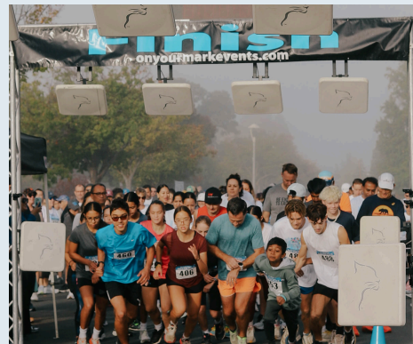
28TH ANNUAL PACE FOR PEACE

In 2025, Tri-Valley Haven's Backpack Drive provided over 685 fully stocked backpacks to K-12 students across the Tri-Valley.