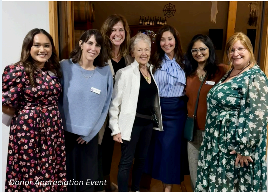
Donor Appreciation Event