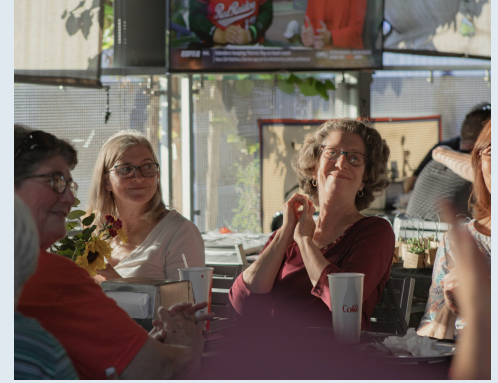
VOLUNTEER APPRECIATION EVENT

Our Donor Appreciation Event celebrated the generosity and steadfast support of those who make our work possible year after year.